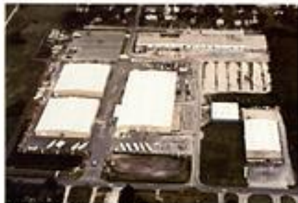
Gulfstar Manufacturing Facility