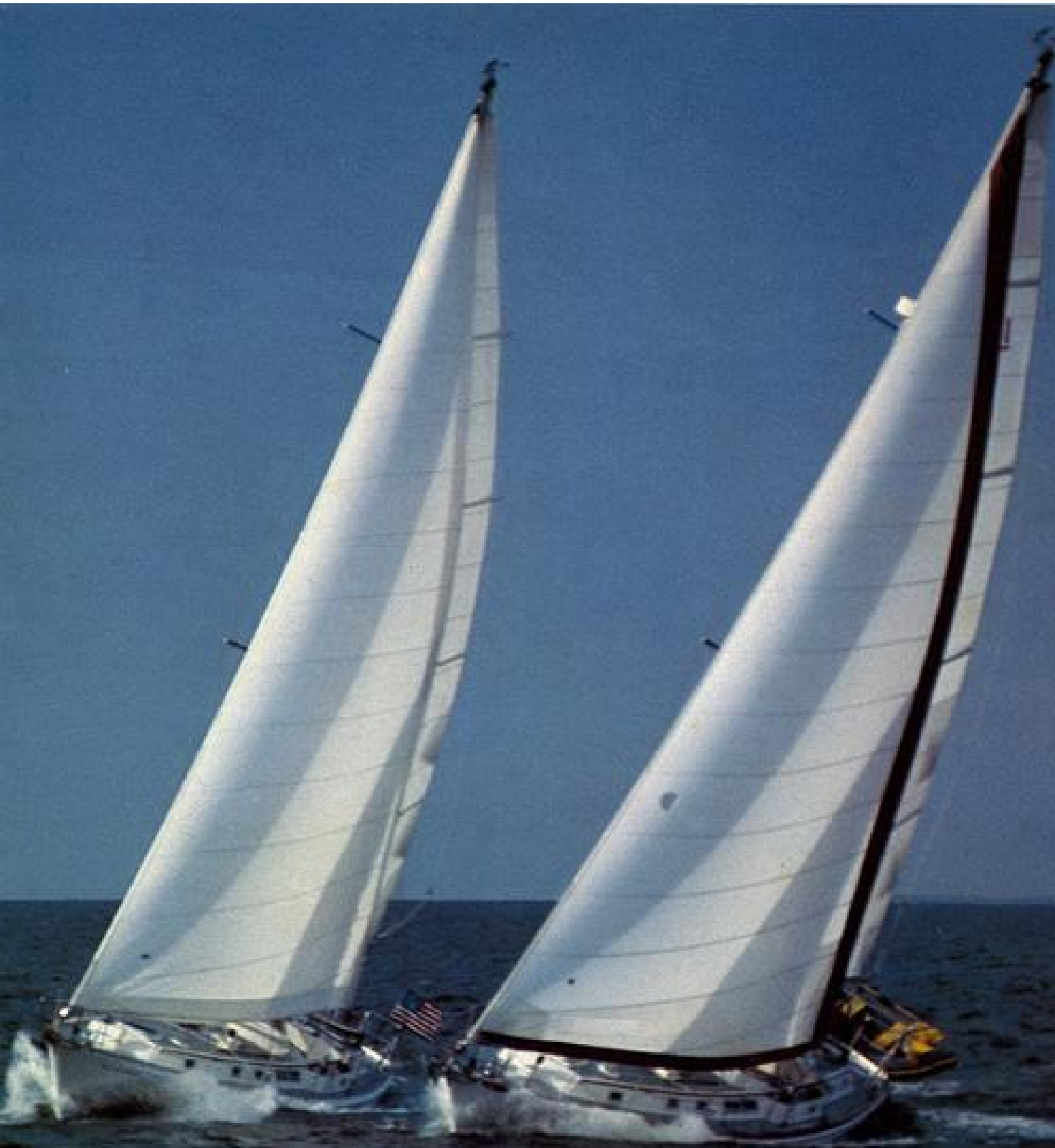
Brewer 12.8-Meter Cruising Cutter